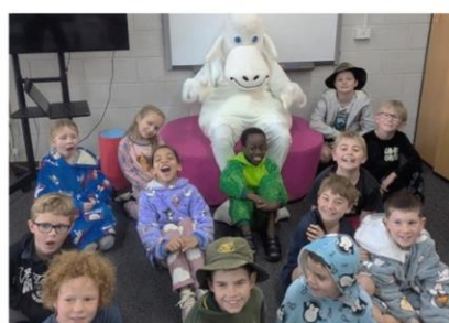
Reward: Dress in PJ's Day

The purpose of the MDHS WA Positive Behaviour Support (PBS) Leadership Team is to create a school family. Our family is clear about how to behave so we can all belong, feel safe, achieve, and show we care. Sheep tags will be awarded in the four CARE colours as part of the whole-school reward system. These tags will be placed, by students, into the four rain gauges near the office, and in the Primary area, with the aim of filling each gauge for a Whole School Reward. Bonus points will be awarded by staff in class and in the playground for demonstrating our PBS values and being a great school citizen. Individual classes may provide tiered rewards for earning sheep tags.