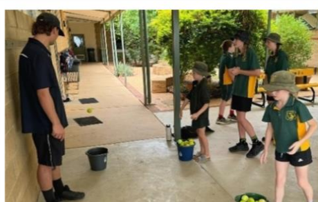
Reward: Minute to Win It Games