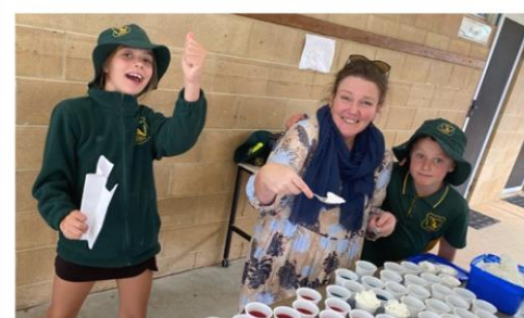
Reward: Jelly & Ice Cream